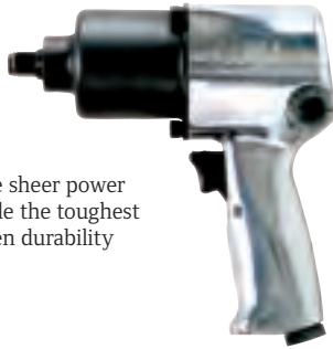
The most popular Impactool in the world