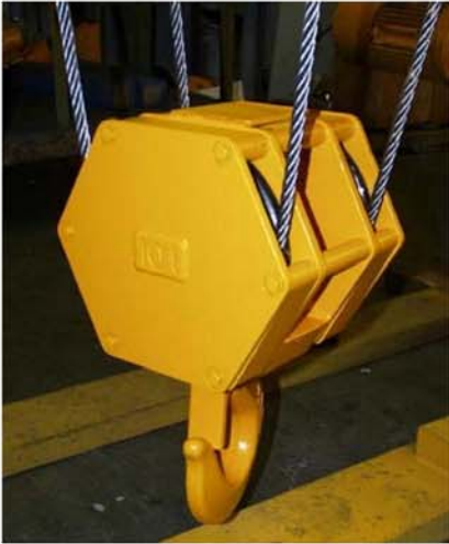
Lubricated Bearings on Sheaves and Bottom Hook