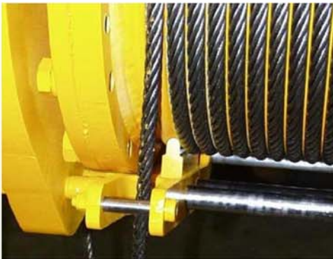
Positive Feed Rope Guide