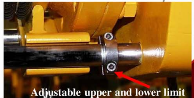
Adjustable upper and lower limit switch stops