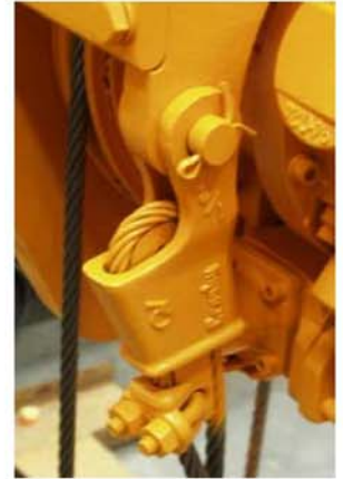
Self-Tightening Cable Anchors